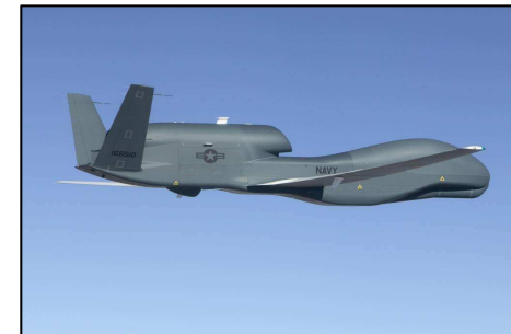
Navy RQ-4A Global Hawk