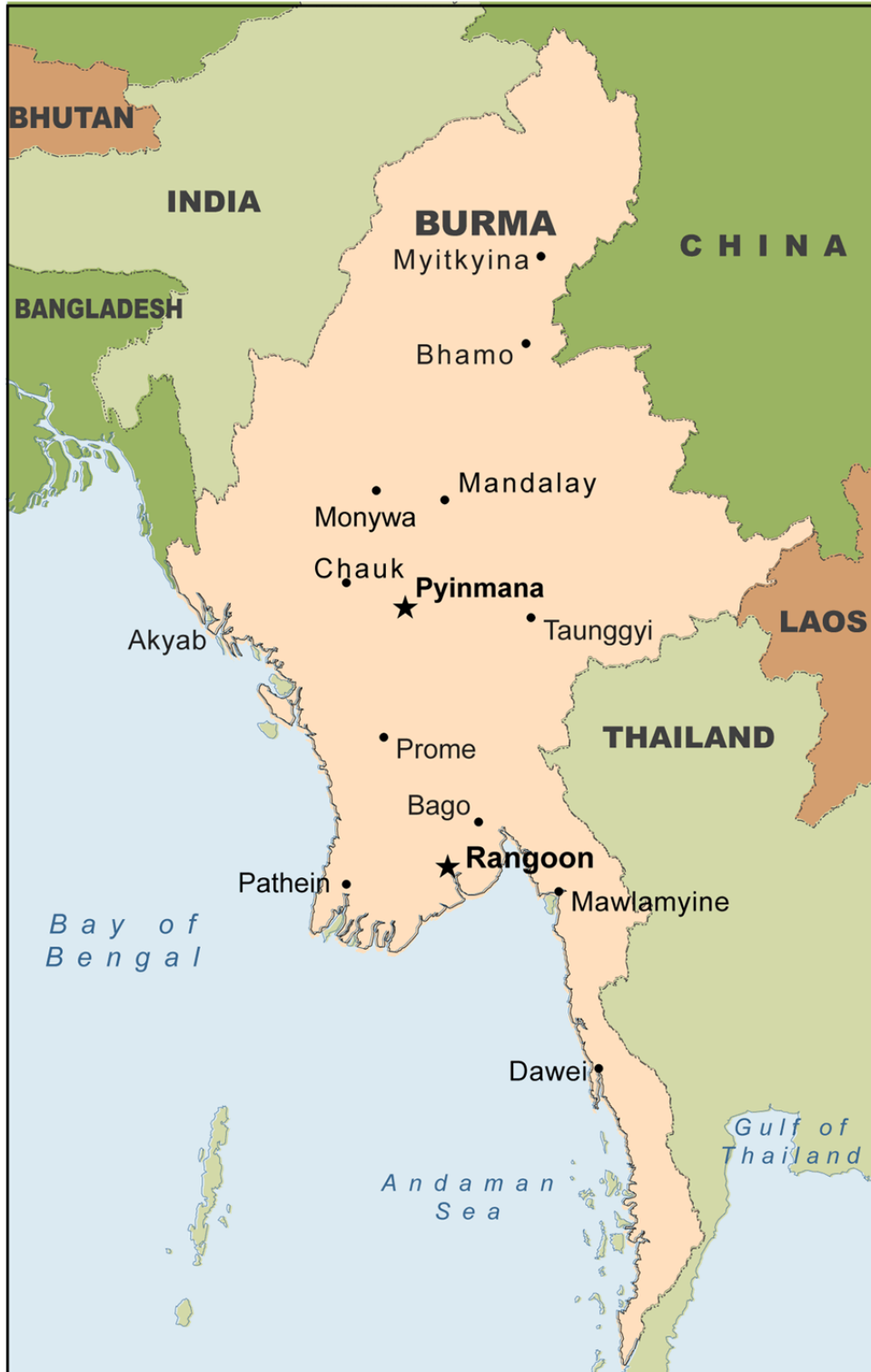
Figure 2. Map of Burma