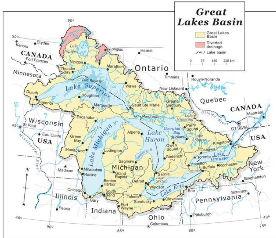
Figure 1. The Great Lakes Basin

Source: Based on a map from The Atlas of Canada . Adapted by CRS. (K. Yancey 3/23/06)