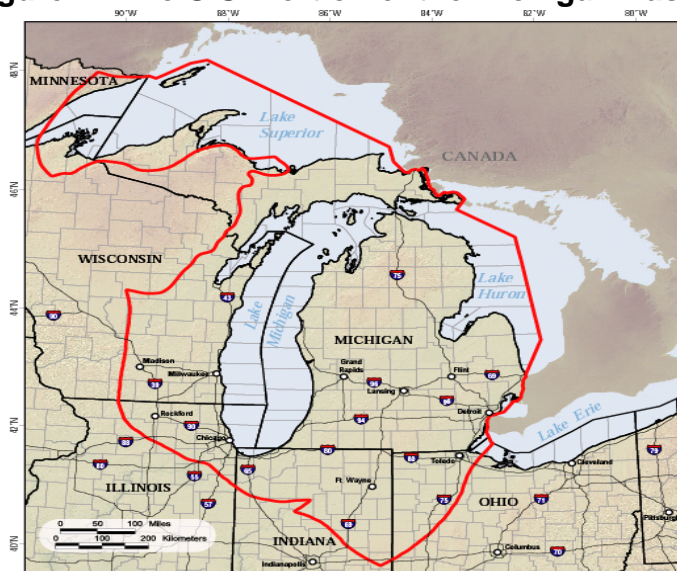
Figure 2. The U.S. Portion of the Michigan Basin.