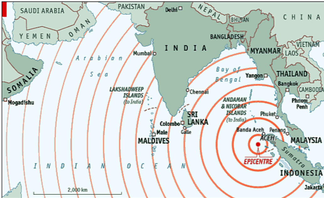
Figure 1. Map of the 2004 Indian Ocean Earthquake and Tsunami