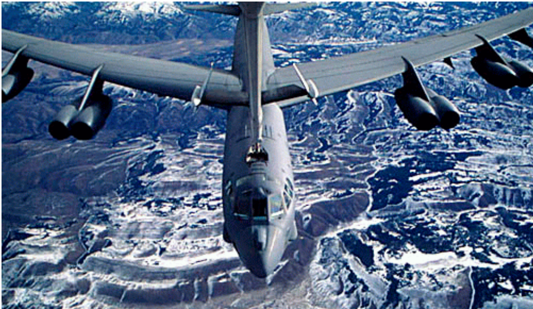
Figure 2. B-52 Stratofortress

The 40-year-old B-52 has remained relevant to a changing battlefield. Although nuclear strikes were its primary mission during the Cold War, the B-52 has carried out important non-nuclear missions in conflicts going back to the Vietnam War. Air Force Secretary James Roche stated recently that the B-52 has transformed three times in its history, from a high-level bomber to a low-level intruder to a stand-off cruise missile carrier to a close air-support aircraft. 26 The B-52 is the only platform that can operate with more than 20 types of bombs and cruise missiles in the U. S. inventory. In high-threat areas where enemy defenses are robust, B-52s employ air-launched cruise missiles (20 per aircraft) to attack ground targets from a distance. In low-threat environments such as Afghanistan or Iraq, B-52s can use JDAM precision bombs or various gravity bombs.