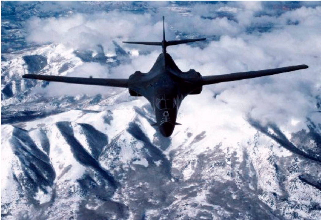
Figure 3. B-1B Lancer