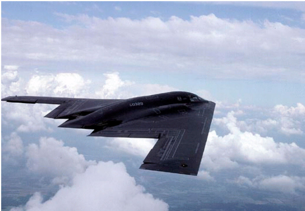
Figure 4. B-2 Spirit