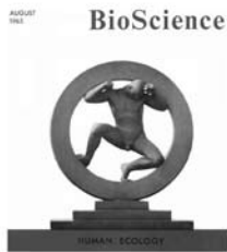
Fig. 5. The August 1965 issue of the journal Bioscience featured Human Ecology research at Cornell and elsewhere.

Foundations and public policy. Albany, NY: SUNY Press.